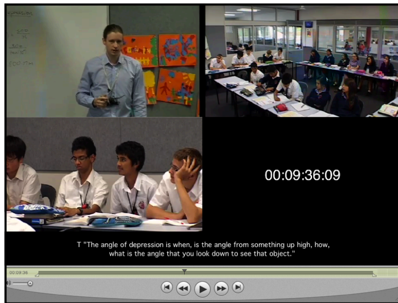
Figure 1. The video “three-up” (three camera angles with time-code and subtitles).

Generating Data. The Australian research team is composed of two mathematics teachers of more than 20 years of experience, a recently graduated teacher, and four academic researchers. All research team members viewed the Australian lesson, whilst the remaining eight lessons were assigned to team members using a matrix structure ensuring at least one experienced teacher viewed each lesson and each lesson was viewed by a minimum of four team members. The prompt used for stimulating thought whilst watching the video was, “What do you see that you can name?” A standardised template was used to record any term that came to mind. It was not necessary to identify a video example of each of the terms generated as the primary purpose of the video was to stimulate thinking about classroom events, actions, and interactions and the recollection of associated terms.